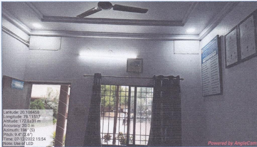
Use of Energy Saving LED Tube light in Institute